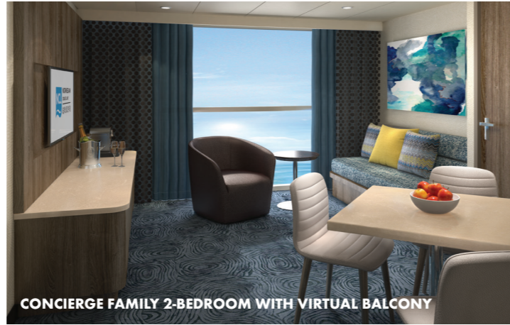
CONCIERGE FAMILY 2-BEDROOM WITH VIRTUAL BALCONY