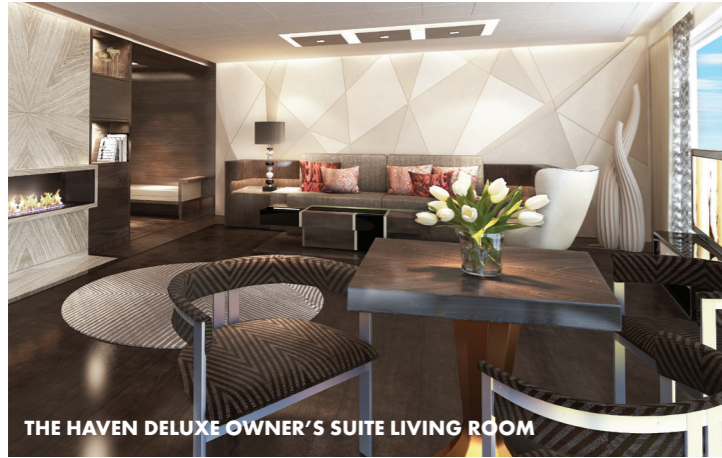
THE HAVEN DELUXE OWNER'S SUITE LIVING ROOM