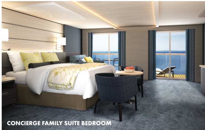
CONCIERGE FAMILY SUITE BEDROOM