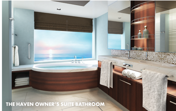
THE HAVEN OWNER'S SUITE BATHROOM